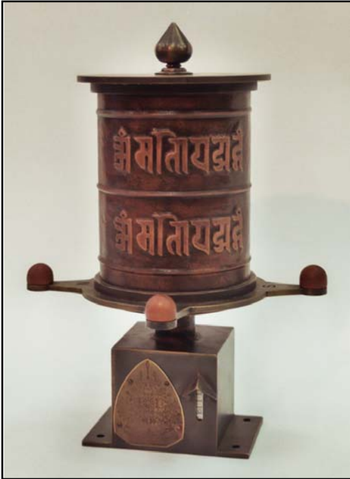
Outside of the Tibet-Tech Prayer Wheel